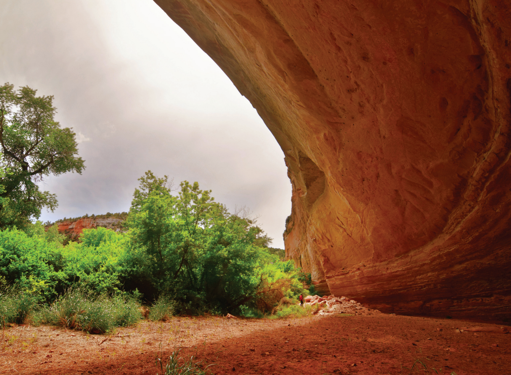
Tensleep arch