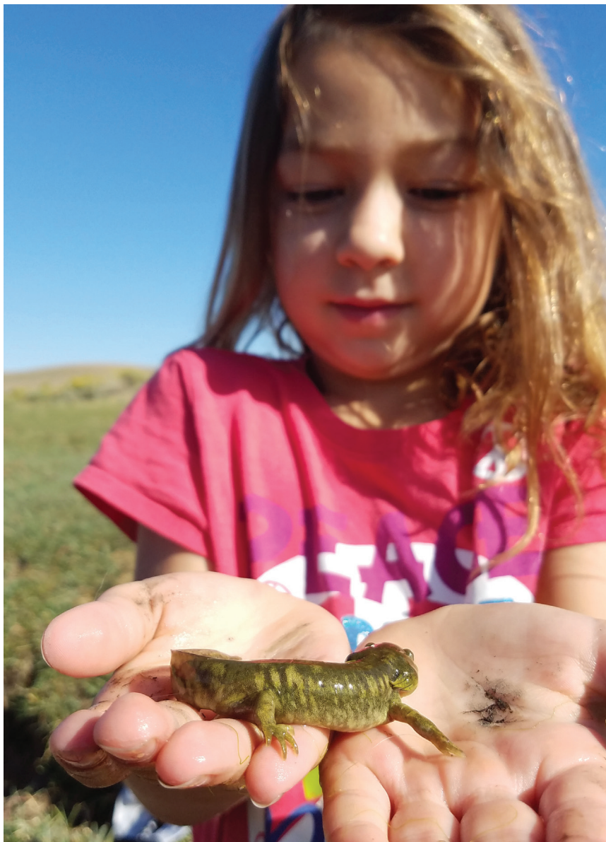
Child with tiger salamander

Five species of large game animals—moose, bighorn sheep, elk, mule deer and pronghorn—find forage and cover here. Miles of streams and river foster robust trout populations, and large predators such as mountain lion, black bear and a variety of birds of prey attest to the vitality of this working ranch.