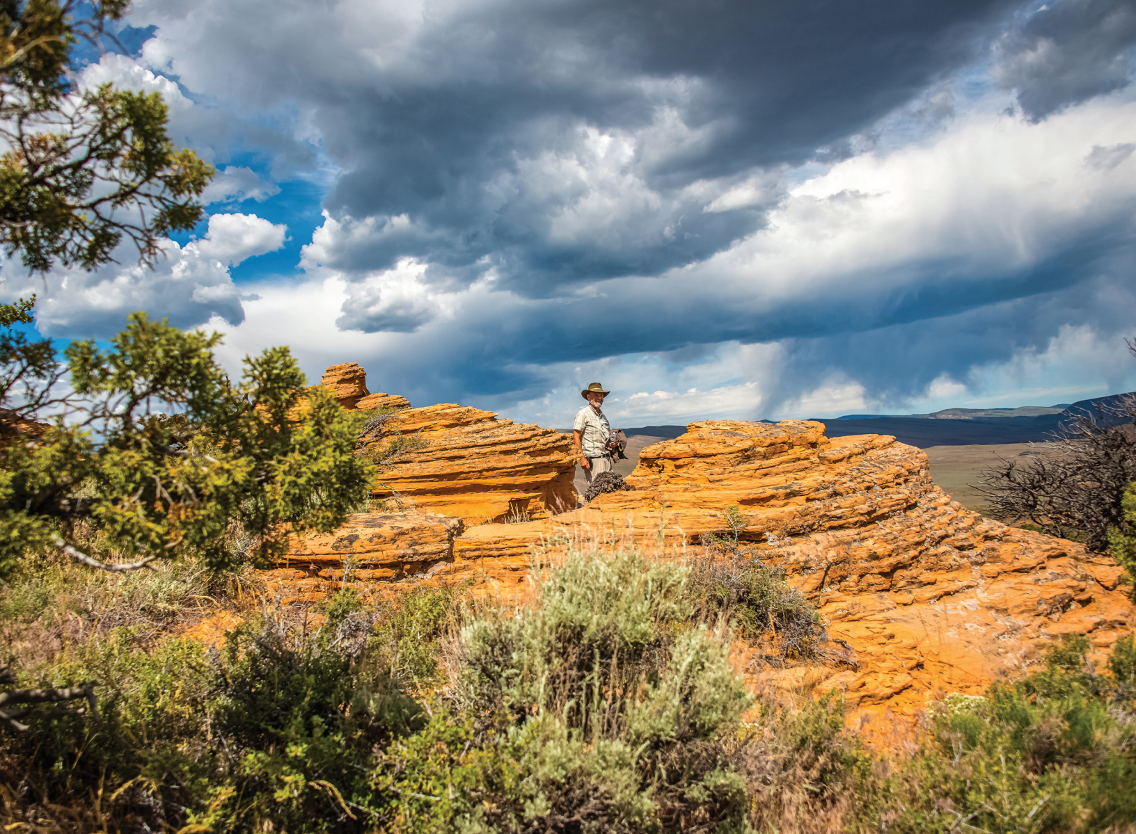
Red Canyon hiker