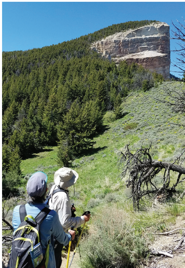
Heart Mountain hikers

Shoshone Indians called this area "Home of the Birds"—golden eagles, sage thrashers, peregrine falcons and sage-grouse thrive here. Native wildlife such as elk, mule deer and pronghorn can be seen, and common predators such as mountain lion, bobcat, coyote and black bears roam nearby. Rare plant species live in great concentrations on the preserve, such as Howard's forget-me-not, Snake River cat's eye, aromatic pussytoes, Absaroka goldenweed and more.