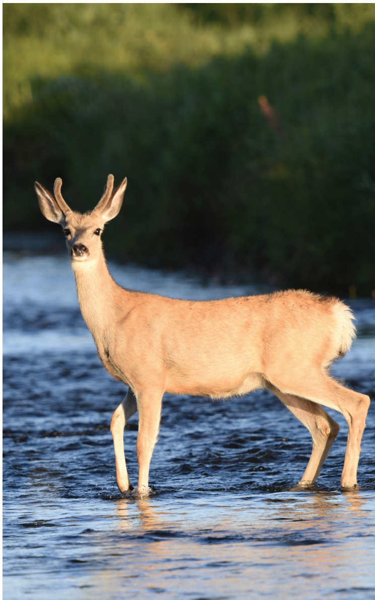
Mule Deer buck

Streamside willow and other plant communities dominate the area and support an abundance of native plants, including the rare meadow pussytoes. Meadows transition to Wyoming big sagebrush and mountain big sagebrush communities in the uplands, where visitors can catch sight of pronghorn. Moose, mule deer, elk, porcupine and beaver can be found along the river and white-tailed prairie dogs can also be seen here. Sage-grouse, white pelicans, sandhill cranes, great blue herons, killdeer and mountain bluebirds make the area their summer home.